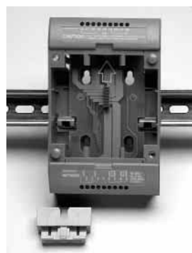
Type 1D DIN Base Plate — Front View