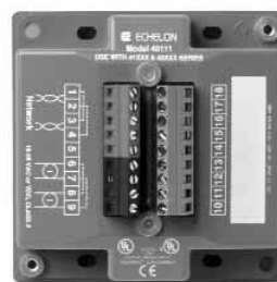
Type 1 Base Plate — Front View

The AO-10 module can be mounted to a Type 1 Base Plate, which is in turn mounted to either a 4" square by 2" deep electrical box or a Type 1D DIN Base Plate (for wall, panel, or 35mm DIN-rail mounting).