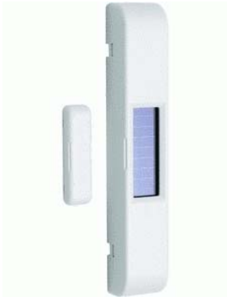
Fig. 3: Window contact

A basic advantage of wireless systems is that the information they send is accessible anywhere in a room or space – not just along the wires. So components can be optimally positioned without bothering about wires already laid and the inaccessibility of places for wiring. Here again, wireless is not just a substitute for wire; instead, it opens-up new application possibilities.