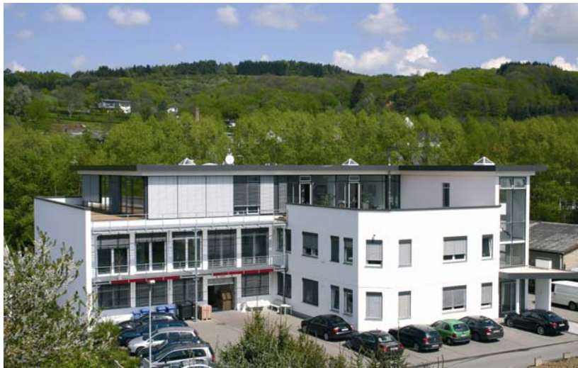
Fig. 5: Office Building with LON/EnOcean Technology

Four EnOcean/LON gateways were installed in the suspended ceilings of the corridors, each communicating with several offices, all featuring room temperature sensors, switches for lighting and blinds, window contacts to monitor the status of balcony doors, and multisensors to detect motion and brightness. Altogether, wireless components were installed in the reception, the kitchen, the lunch room, the engineering offices, the conference room, and six offices (the largest more than 1000 square feet).