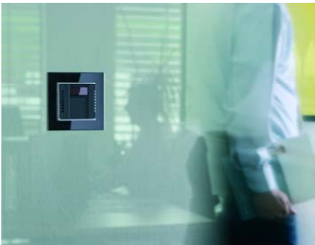
Fig. 8: Wireless Sensor on glass

The installation is a good illustration of seamless interaction between wired LON sensors and EnOcean-enabled wireless components. The gateways are above the suspended ceilings in the corridors. Apart from 230 Vac sockets and the computer network installed in floor tanks, the offices are cableless, avoiding any excessive cost if and when the rooms are reconfigured.