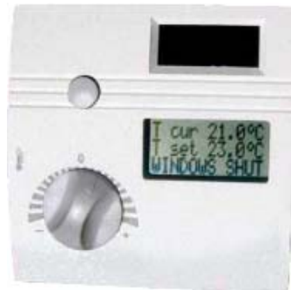
Fig. 4: Bidirectional wireless room sensor