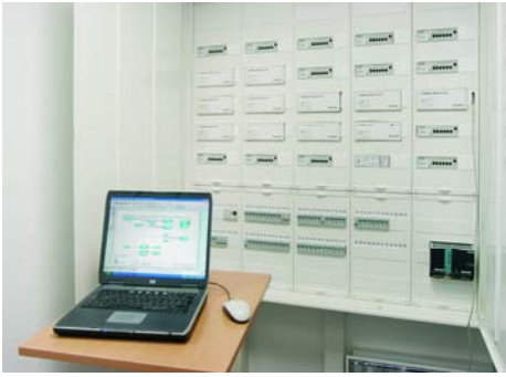
Fig. 6: LON service room