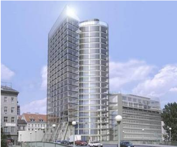
Fig. 1: UNIQA Tower in Vienna, where the backbone links a large number of floors

But signal transmission within the same floor in a radius up to about 30 meters is easily handled by EnOcean wireless technology. What matters here is the choice of sub-gigahertz frequencies (868 MHz in Europe and Middle East and 315 MHz in the USA and Far East) that, in contrast to wireless systems like ZigBee and Bluetooth nestling in the 2.45 GHz band, exhibit especially low attenuation through walls, and achieve about twice the range for the same transmitting power.