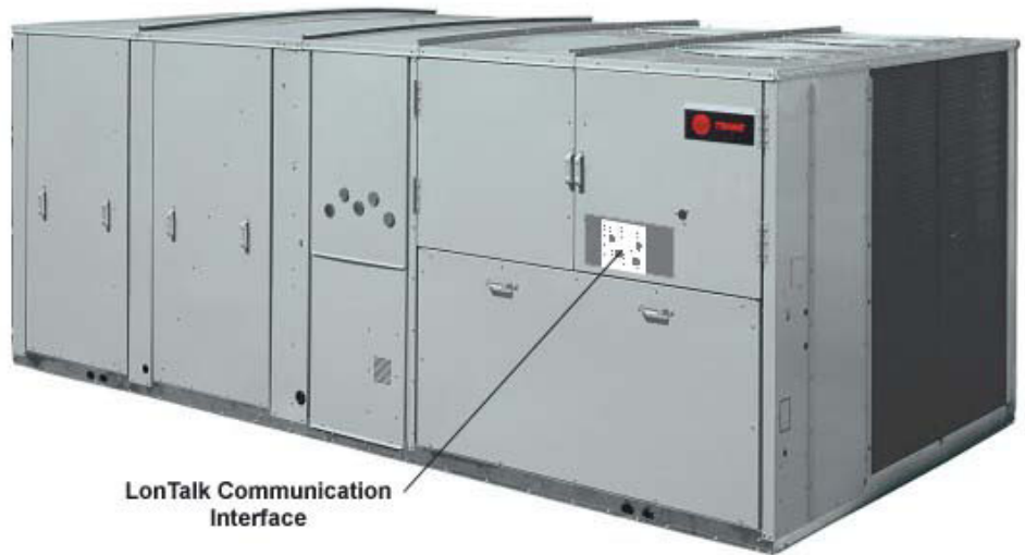
LonTalk Communication Interface

Voyager™ Commercial Rooftop air conditioner with LonTalk® communication interface for ReliaTel® control